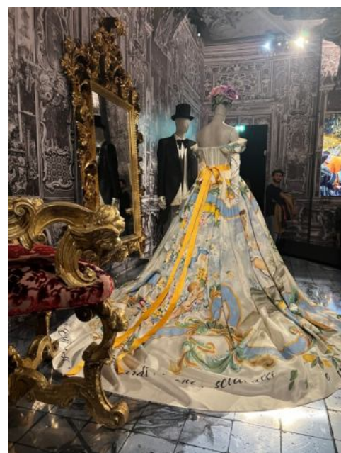
The Gattopardo room contains scenes from the movie "The Leopard."