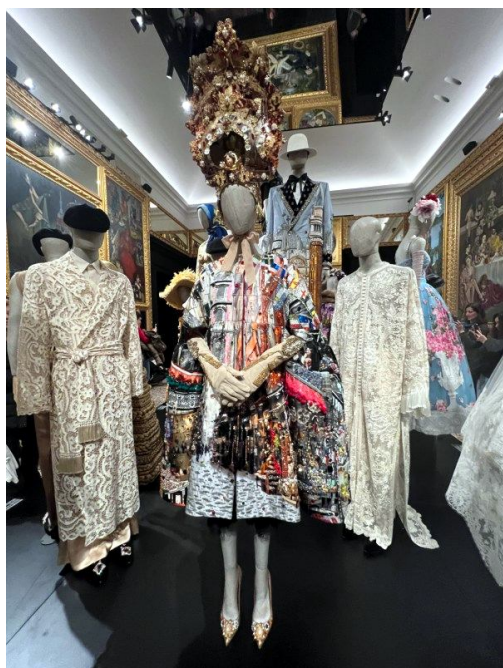
From the mirrored ceiling to the walls covered with inspiration, there is too much to take in at once.