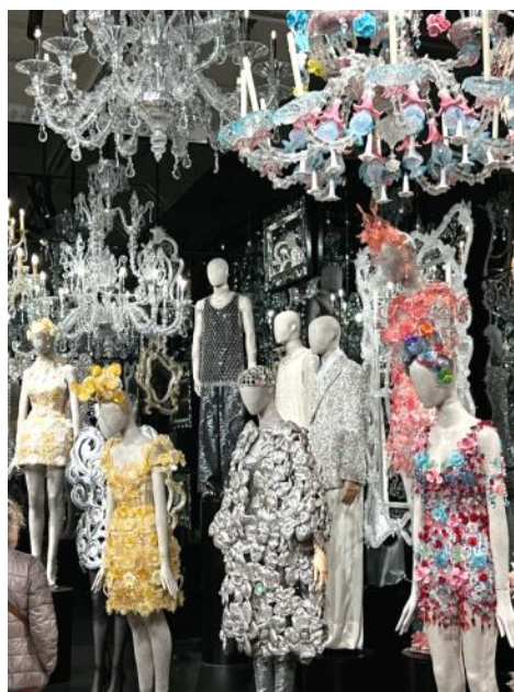
In the second room the ceiling is completely covered with chandeliers and the soundtrack is shattering glass.