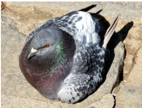
Even the pigeons are relaxed here.