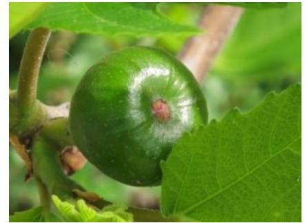
Brand new figs are on the trees.