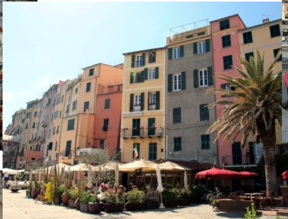
There are also some interesting places in the street above the harbour.