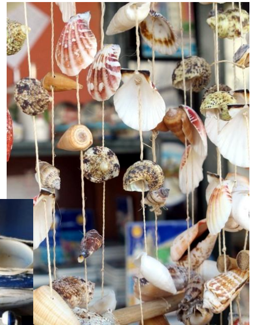
There are always lots of seaside souvenirs to buy.