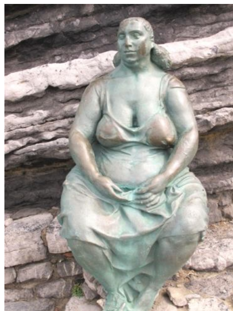
And the Signora is still waiting for her ship to come in.