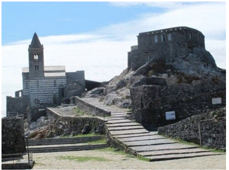
We wandered up to the church on the point to see the gorgeous view.

Deciding where to eat in Portovenere is never easy. There are lots of great looking places along the waterfront.