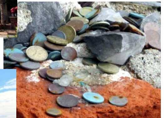
Take a close look at the ledge. There are some old coins corroding there.