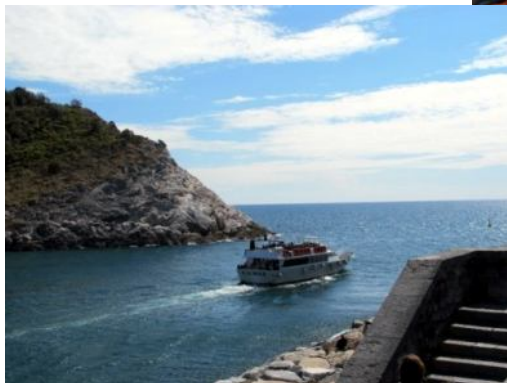
The restaurant is right at the end of the point where the boats pass on their way to Cinque Terre.