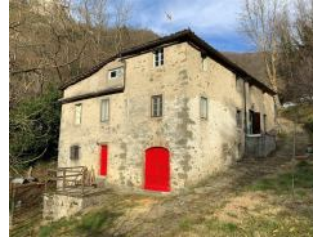
Ref. 315, Pescaglia, € 235,000. APE class D