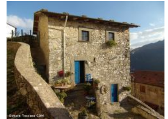
Ref. 302, Colognora (Piazza al Serchio). € 300,000. APE class G

Agenzia Immobiliare Dimore Toscane srl Via Marconi 14, Barga - Lucca - Italy