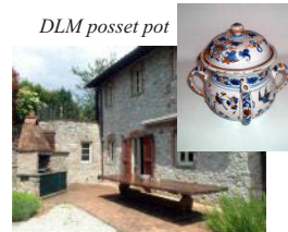
DLM posset pot