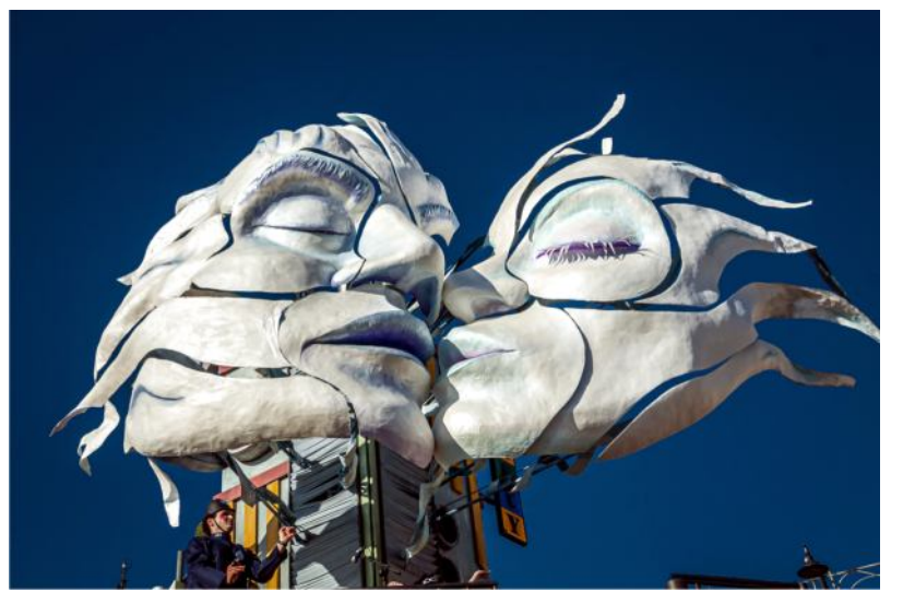
Carnival in Viareggio, March 2021