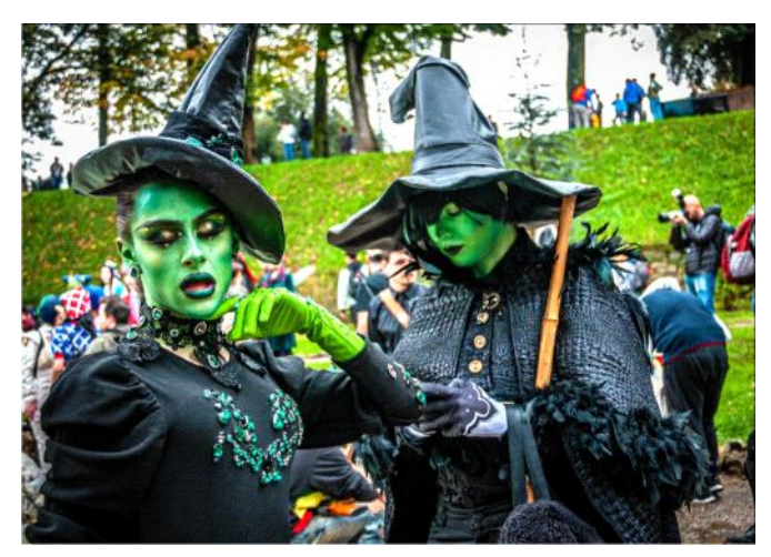
Comics & Games, November 2021