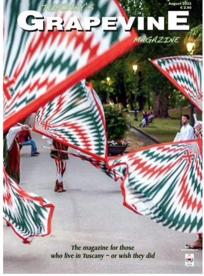
The magazine for those who live in Tuscany or wish they did