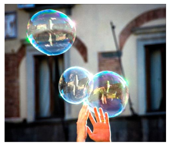
The Importance of Light, article by Maria Tsaosidou. December 2017/January 2018

Dream, 1968. Shown at Palazzo Blu (Pisa) in 2018