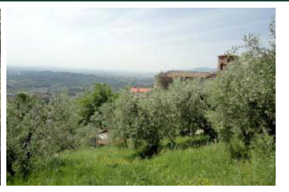
Casa Silvanna - Guide price €390,000

This detached house is situated in the ancient and picturesque hillside village of Petrognano around 25 minutes to the east of Lucca. Laid out over three floors, the house measures about 124 sqm. The restoration has preserved many delightful original features of the house, including beautifully patterned tile floors and decorative friezes adoming the walls and ceilings in some of the rooms. There is the possibility to build a pool in the surrounding garden, which extends into an olive grove. Energy classification G - 266.933/kWh/smg year.