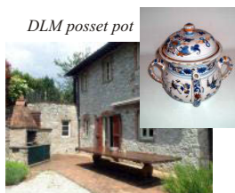
DLM posset pot

Moving Sale Lucca Whole house contents of quality for sale including antiques, wardrobes, piano, furniture, mirrors, paintings etc. Please email leverwoman82@gmail.com for list. (Ref. 1100)